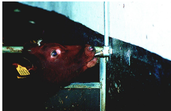
Less spillage will reduce wastage output